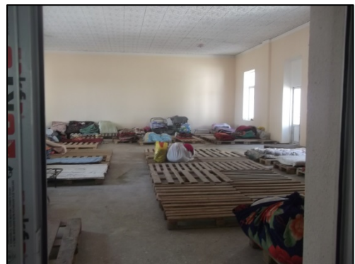
Accommodations for children and adults sent to pick cotton in Syrdarya region, September 2013.