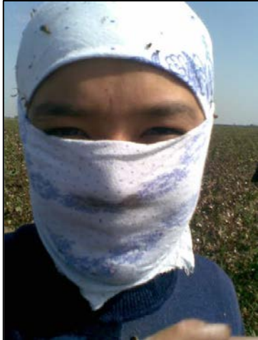
Teenager picking cotton, October 2013

cotton fields the authorities told us that representatives of international organisations might come and ask us questions, and that we must answer that we came to the cotton harvest to help out the state. In these circumstances, no one will tell the truth in the presence of government officials.” 105