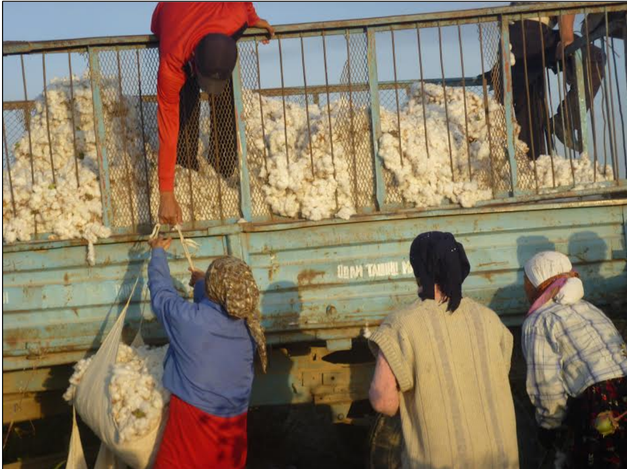
Delivering cotton to the trailer, October 2013.

buildings in the countryside. Adults and children often slept on the floors and reported a lack of washing facilities, heat, electricity and adequate food. A week into the harvest, children from Colleges in Tashkent fled the cotton fields because of the poor living conditions. Those with resources paid local residents 500-1000 soums ($0.23 - $0.47) per night to sleep in their houses Many students fell ill and were sent home early. 88