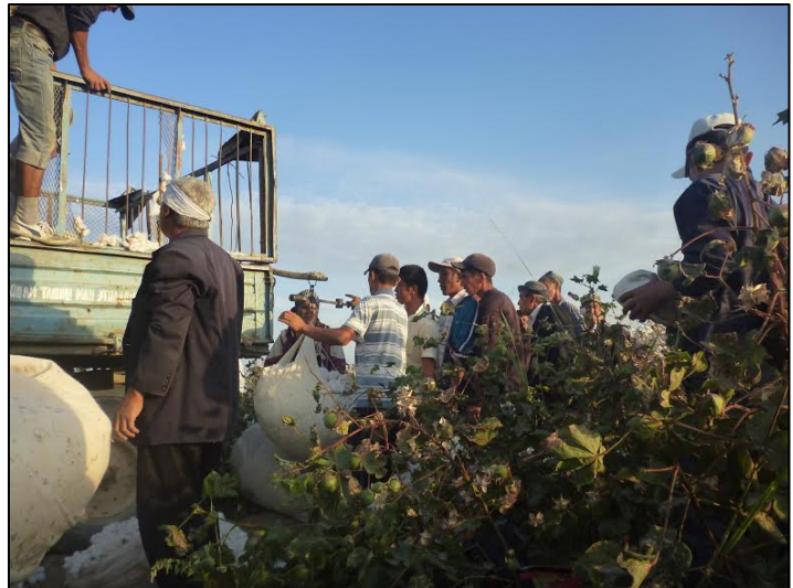
Weighing cotton, October 2013.

Many people were unable to pick enough cotton to fulfil their daily quotas and therefore had to pay farmers or local residents for the cotton they needed to make up the shortfall. In many cases, authorities also passed the cost of transportation and food to citizens sent to pick cotton. 70 Some students reported that school officials under-recorded the weight of cotton delivered. 71 As a result, many people forced to pick cotton contributed both their labour and their money to the state-controlled cotton harvest. Many who struggled to fulfil their cotton quotas also reported suffering verbal abuse, threats of punishment and, in some cases, physical abuse.