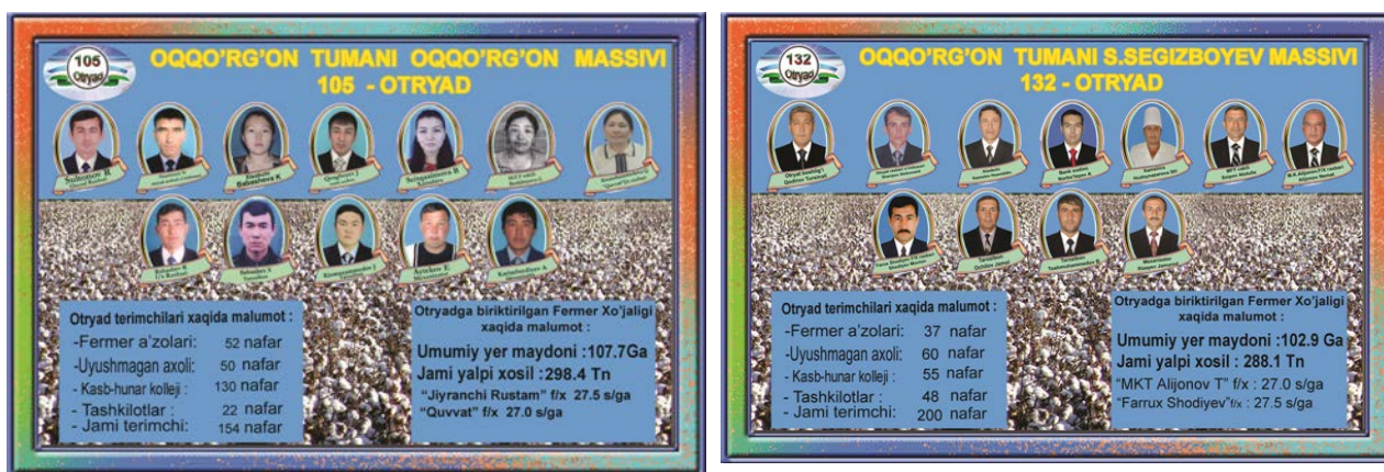
Authorities in Akkurgan, Tashkent region, issued these photos of “Brigade 105” (left) and “Brigade 132,” (right) that includes details of how many people worked in the brigades, how much cotton they harvested and which farms they worked on.

This report updates the Review of the first month of the 2013 Cotton Harvest in Uzbekistan . The evidence presented herein on the continued use of forced labour in the 2013 cotton harvest was gathered by human rights defenders in Uzbekistan through interviews and observations during the harvest. They also reviewed government documents and collected both local and international media reports on the cotton harvest. Information was gathered from seven regions. Each region had a group of local monitors who monitored the cotton harvest from beginning to end. All interviewees had direct experience of participating in the 2013 cotton harvest. The interviewees were from different families and different schools. The teams of human rights defenders received training on monitoring and interview techniques by a social scientist. The monitoring teams operated anonymously for their personal protection.