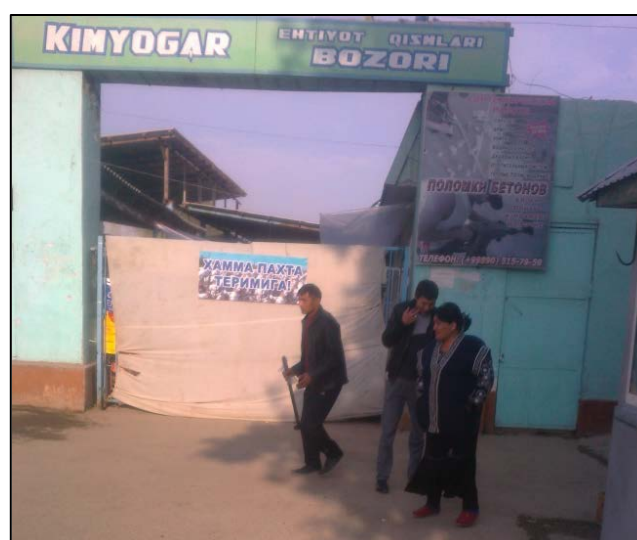
Closed market. The sign states, "Everyone goes to the cotton harvest!"

Many public institutions sent their workers to pick cotton for shifts of 10-15 days. 62 The regional governor of Namangan issued a statement on September 13 that all students of the three regional universities and all workers of private and public-sector institutions would pick cotton. 63 In a statement delivered at Tashkent's South Station on September 17, the Mayor of Tashkent ordered city residents to pick cotton in Jizzak region. 64 In Syrdarya region, local authorities closed markets to prevent people from avoiding work in the cotton fields. 65 In Kashkadarya region, authorities informed residents that