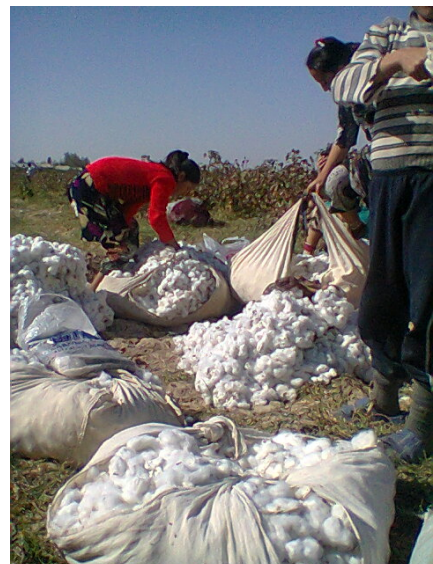
School administrators sent schoolchildren to pick cotton in Yakkabog district, Kashkadarya region, October 2013.