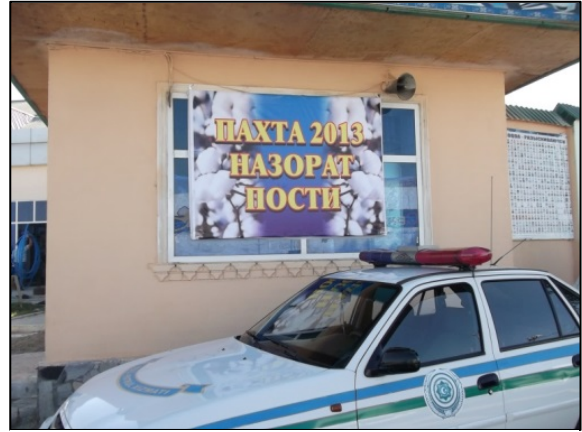
Police office to oversee the cotton harvest, Syrdarya region, September 2013.

When the ILO monitors arrived in September, government authorities throughout the country had already instructed citizens to report to foreigners that they picked cotton “for the love of the motherland.” 95 Even private business owners in Tashkent region followed orders to instruct their staff to respond to questions from the ILO mission by stating that they picked cotton “voluntarily, to raise the economy of the country and work hard for our motherland.” 96 Education officials instructed students to report being over age 18 if they are asked by foreigners while picking cotton and returned students from the cotton fields to schools in anticipation of visits by the ILO. 97 Fergana regional authorities ordered all residents to have children pick cotton away from main highways. 98 In advance of an ILO visits to colleges, school officials sent the students back to school from the cotton fields. 99 A student wrote to Radio Liberty, “I am first-year student from Samarkand Judicial College. We were also sent to pick cotton. Our teachers told us that if the Commission comes we should say that we are second-year in the college. What is happening? It seems illegal.” 100