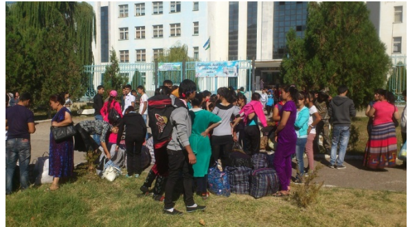
Mobilization of college students, September 16-17, 2013, Tashkent region.