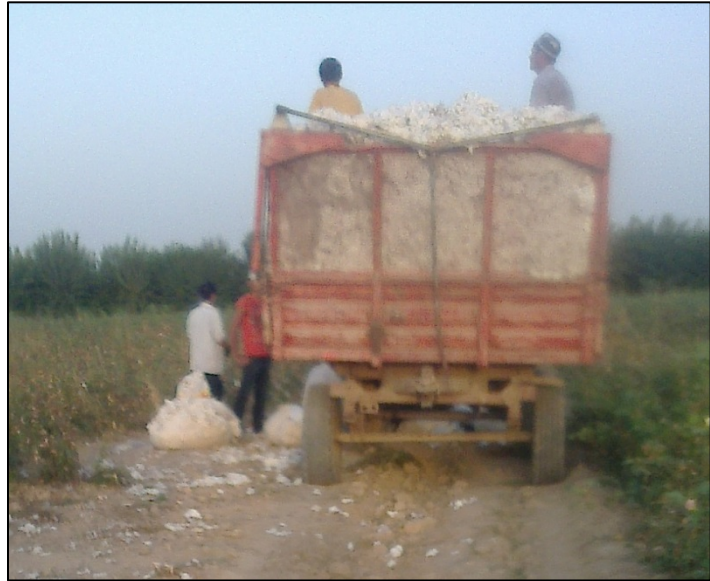
Trailer taking cotton from the field, October 2013.