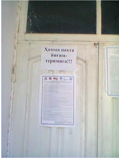
A college closed for the cotton harvest, Kashkadarya region, October 2013. The sign states, "Everyone goes to the cotton harvest!"