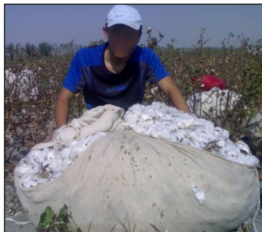
Teenager picking cotton, Andijan, October 2013.

As in previous harvests, in 2013 the government systematically forced children, primarily students from colleges and lyceums (aged 15 to 18), to pick cotton, under threat of expulsion from school. Children in Uzbekistan enter colleges and lyceums at age 15 or 16. 4 According to national statistics, 1.7 million students attended colleges and lyceums in 2012, and over one third of the first-year college and lyceum students were 15 years old. 5